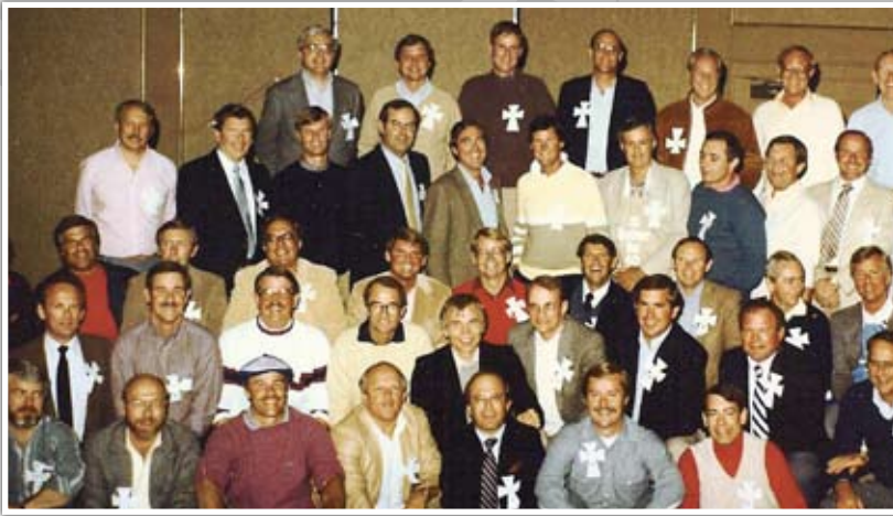
1984 Beta Phi Chapter Homecoming Reunion

Beta Phi Chapter of Sigma Chi Fraternity, The University of Arizona